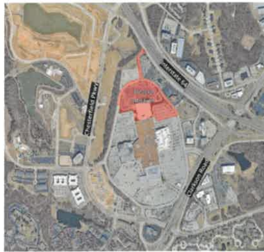
Figure 2: 16-acres to be added to “PC&R” district

The existing district was broken down into “Area 1”, “Area 2” and “Area 3”. The areas were then further broken down into conceptual parcels in order to allocate permitted uses and density. The proposed 16-acre parcel of land would be incorporated as “Area 4”. These areas may be seen in the attached packet on Sheet C1.0. The permitted residential units for the existing district have already been allocated between the existing conceptual parcels thus the permitted uses for proposed “Area 4” would be limited to commercial development. The density of the commercial development for “Area 4”, as written in the Attachment A, is a maximum of 280,000 square feet which is the square footage of the existing building. The modifications made to the Attachment A for this ordinance amendment have been depicted in red font.