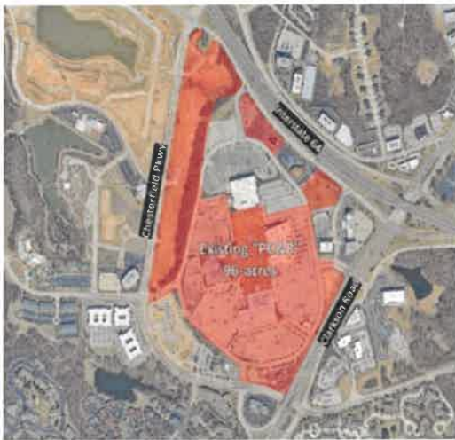
Figure 3: Existing “PC&R” district

The existing “PC&R” district encompasses roughly 96-acres of land and was established in 2023. The approximate boundaries of this district may be seen in Figure 2. The 16-acres proposed to be incorporated into this district may be seen in Figure 3.